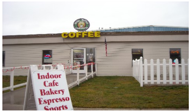
CdAAA Meeting place Miles Coffee Company, 167 W. Miles Hayden, ID 83835