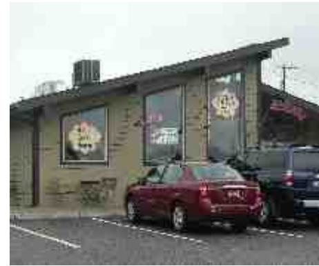
Cd'AAA Meeting place Donut House, 8761 N. Gov't. Way Hayden, ID 83835

Welcome new or renewed members for 2015: