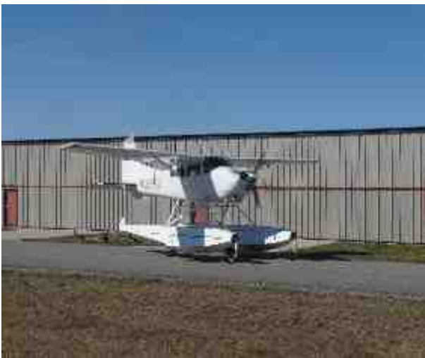
Clockwise from top: Super Cub seaplane vs. Burt Rutan's Catbird, Pappy Boyington statue and flags near Resort Aviation, Terry and Mike departing for GoPro camera test, Mike Zaidlicz and Charlie Watching Embraer Phenom 100, 300, Legacy 500 and other airplanes from the planned visitor pavilion and restrooms area. flies 3.2 times as fast as the Super Cub, and it can land on water, only once.”